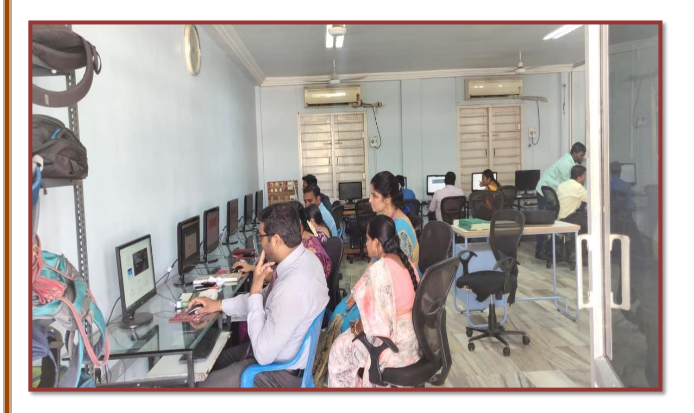
Lab Session to faculty