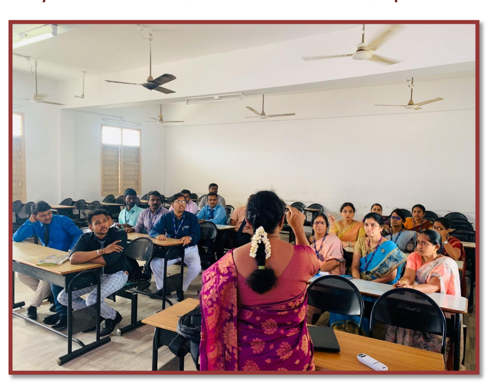
Staff at the Programme